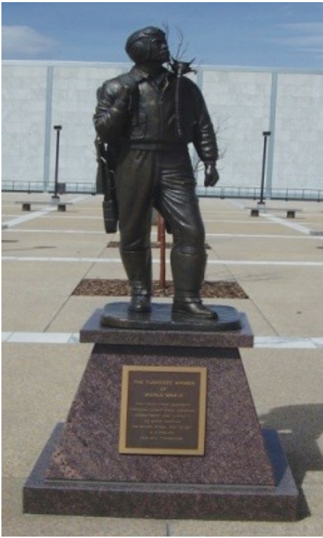
Tuskegee Airmen of World War II By Lt. Col. Clarence Shivers, DOTA USAFA